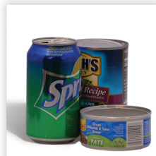
Aluminum and Steel Cans empty and rinse