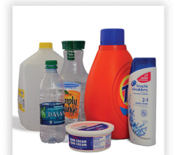
Kitchen, Laundry, Bath: Bottles and Containers empty and replace cap