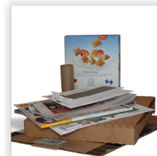
Mixed Paper, Newspaper, Magazines, and Flattened Cardboard