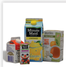
Food and Beverage Cartons empty and replace cap